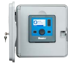
Plastic Wall Mount Height: 16 3 / 8 " Width: 16 1 / 2 " Depth: 6 5 / 8 "