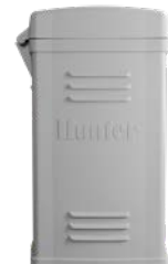
Plastic Pedestal Height: 39 1 / 2 " Width: 23 1 / 2 " Depth: 17"