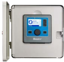
Metal Wall Mount Gray or stainless Height: 15 7 / 10 " Width: 15" Depth: 6 4 / 5 "