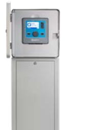
Metal Pedestal Gray or stainless Height: 37" Width: 15 1 / 2 " Depth: 5"