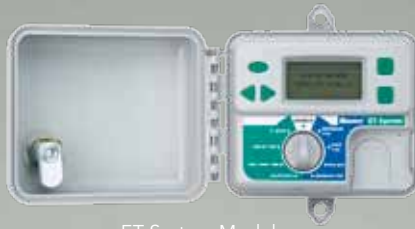
ET System Module