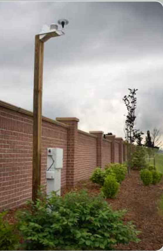
SWAT™ Performance Summary and Technical Report now available at www.irrigation.org