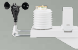
ET System Sensor (Shown with optional ET WIND)