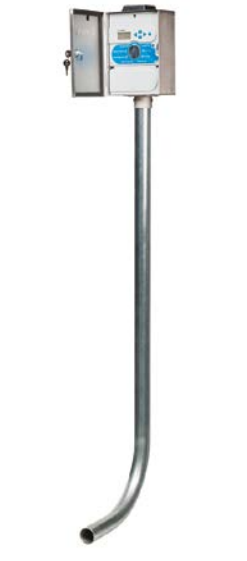
XCHSPOLE Pole-mounting kit (optional) Height: 4'