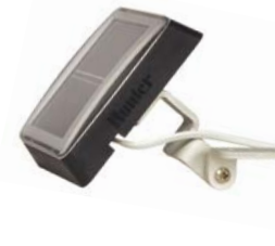
SPXCH Solar panel kit (optional) Height: 5 5 / 8 " Length: 3" Width: 3"