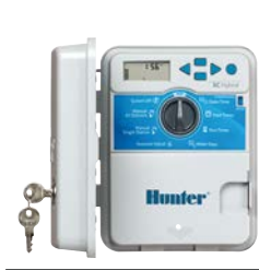
Plastic Height: 8 5 / 8 " Width: 7" Depth: 3 3 / 4 "