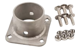
XCHSPB Mounting bracket and hardware only (optional)