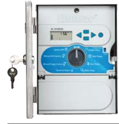
Stainless Steel Height: 9 3 / 4 " Width: 7 3 / 8 " Depth: 4 1 / 4 "