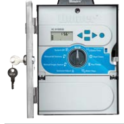
Stainless Steel Solar Height: 10 3 / 4 " Width: 7 3 / 8 " Depth: 4 1 / 4 "