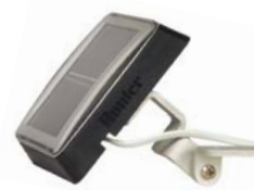
SPXCH Solar Panel Kit (optional) Height: 8 cm Length: 25 cm Width: 8 cm