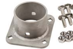
XCHSPB Mounting bracket and hardware only (optional)