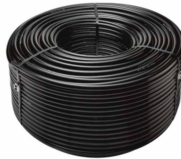
1/2" PE Tubing

1/2" PE TUBING – SPECIFICATION BUILDER: ORDER 1 + 2 + 3